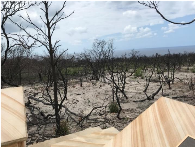
9 February 2021

For more information see https://www.artilleryhistory.org/memorial_walk.html As you can see the bush is still recovering from the fire, but the Xanthorrhoeas are doing well.