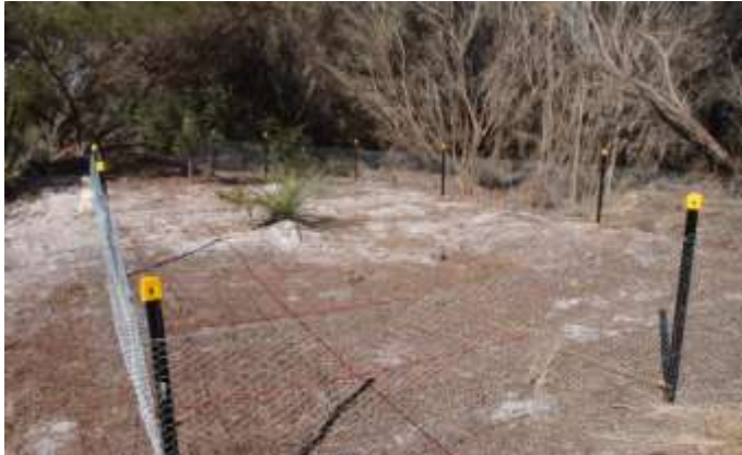
First cleared plot showing quadrats and fencing to keep out the rabbits. Taken 3 August 2012.