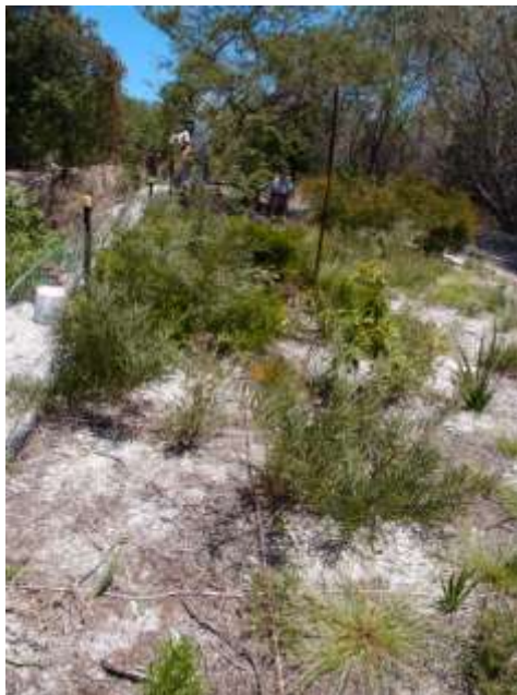
Recording the plant species on 17 December 2013