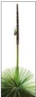
Xanthorrhoea + Lorikeet