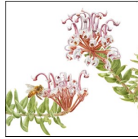
Grevillea buxifolia with bee