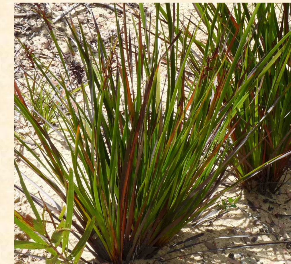
Lepidosperma laterale ESBS Variable Sword Sedge