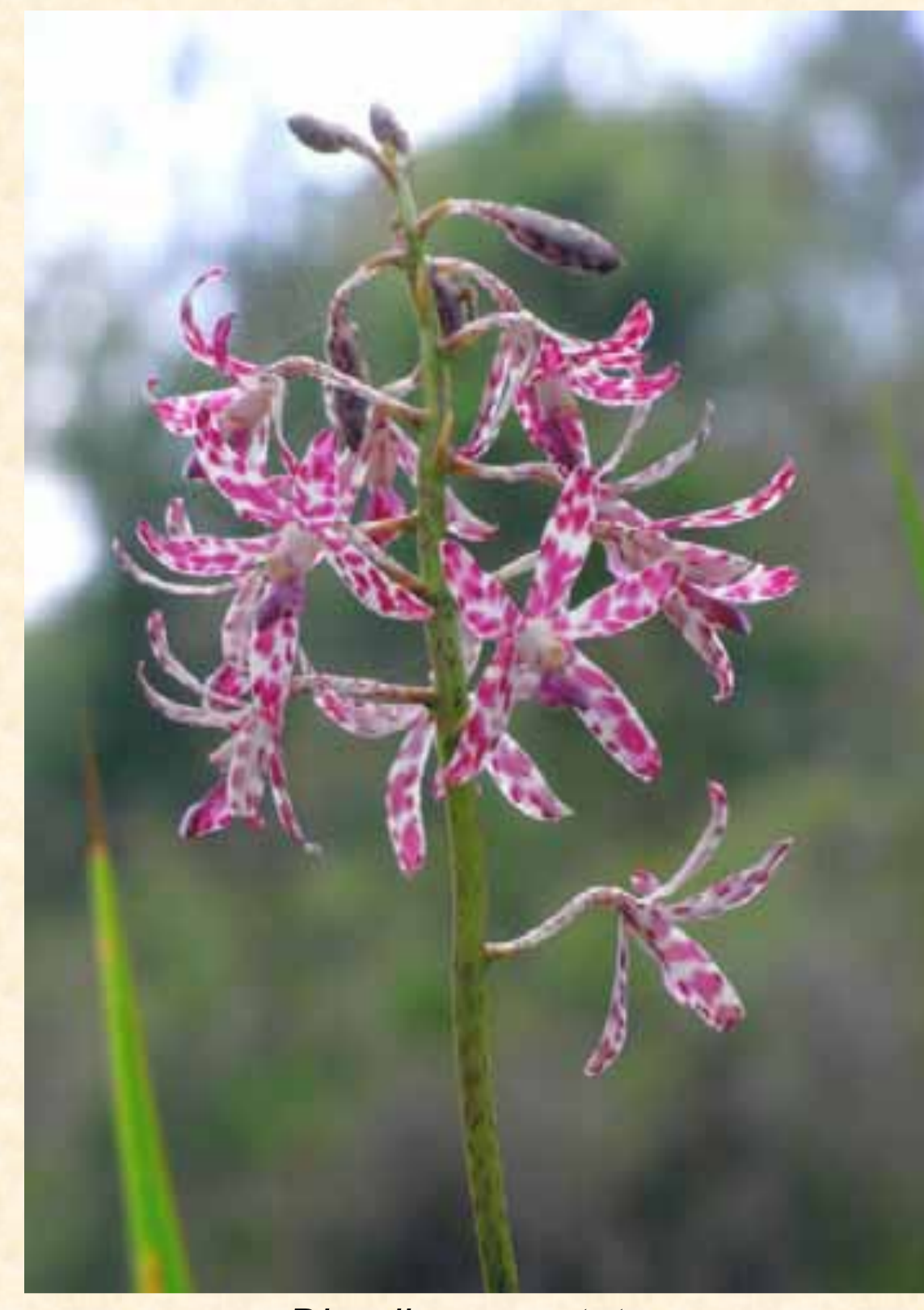
Dipodium punctatum Hyacinth Orchid