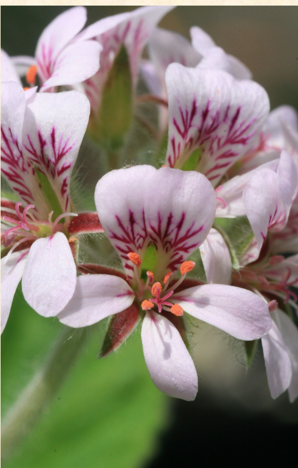
Pelargonium inodorum Kopata