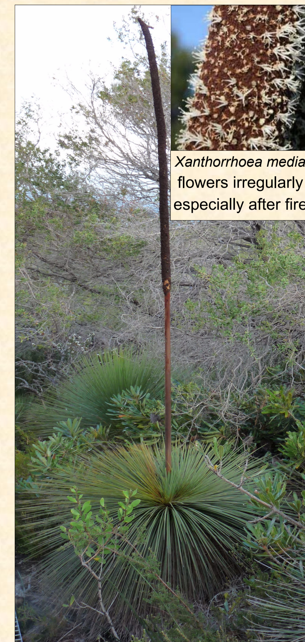
Xanthorrhoea media flowers irregularly especially after fire