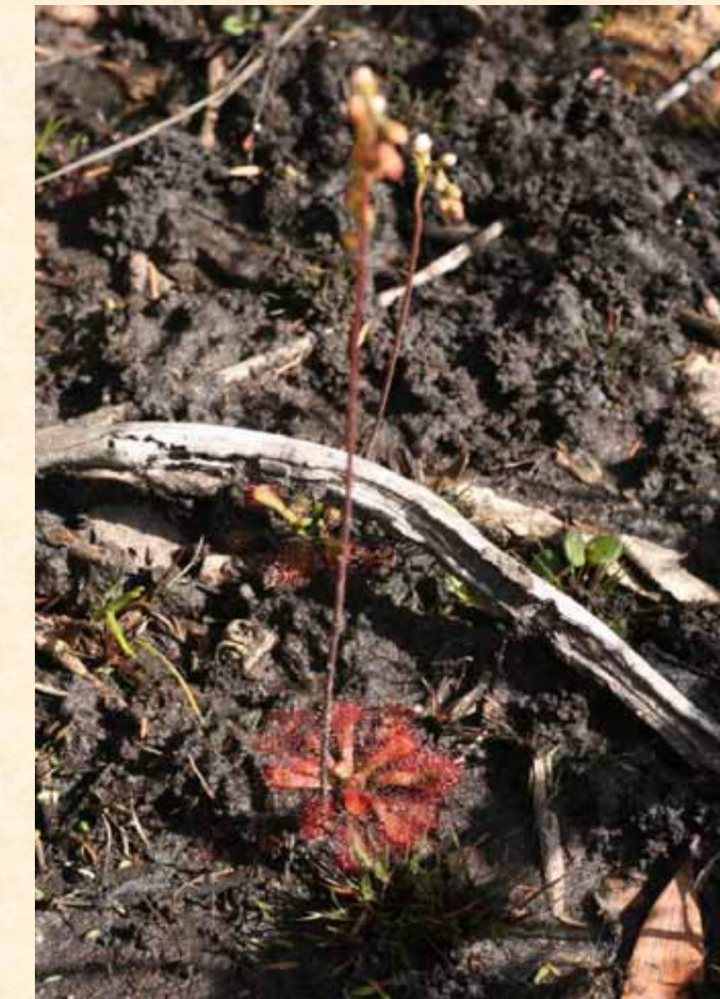
Drosera spathulata Common Sundew