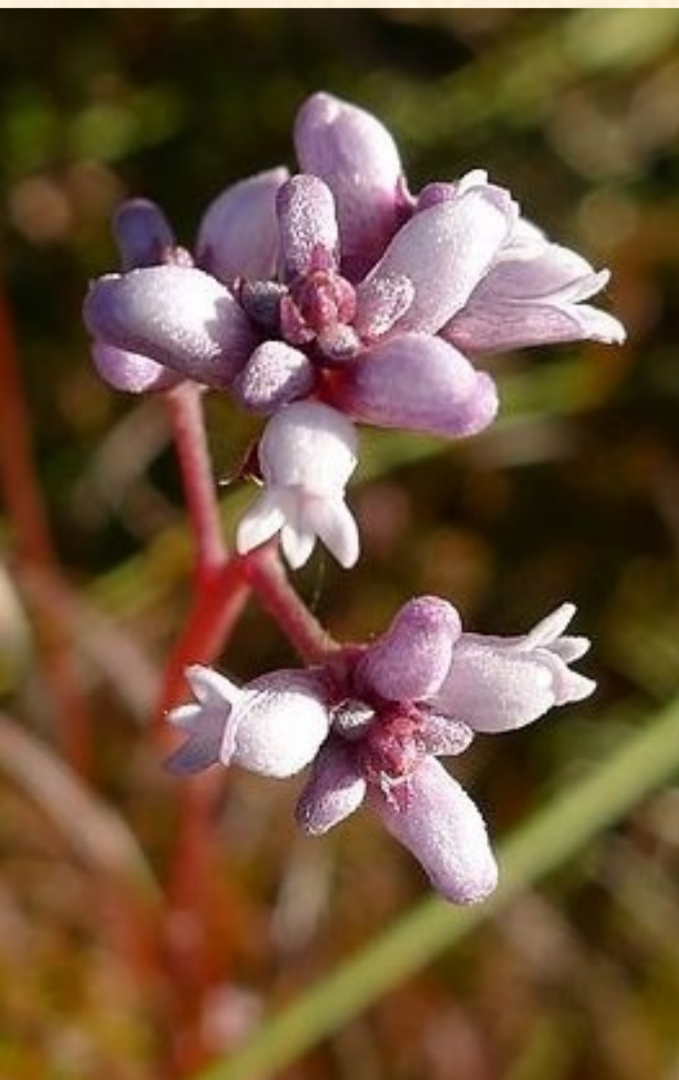
Conospermum tenuifolium Sprawling Coneseeds