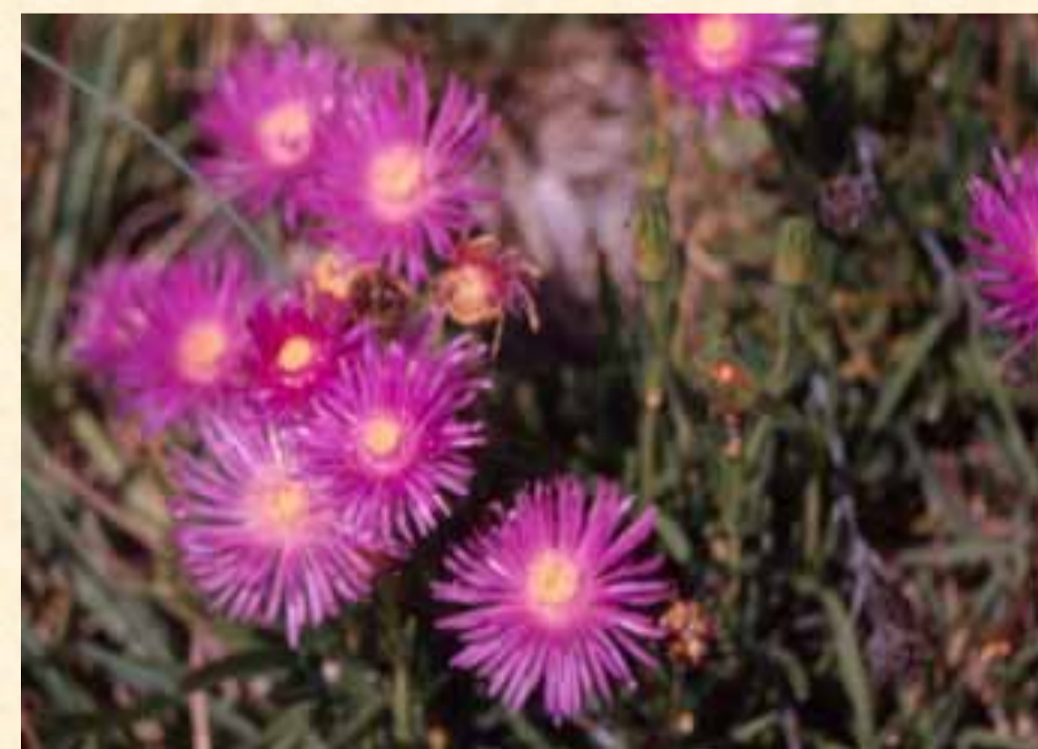
Carpobrotus glaucescens Pigface