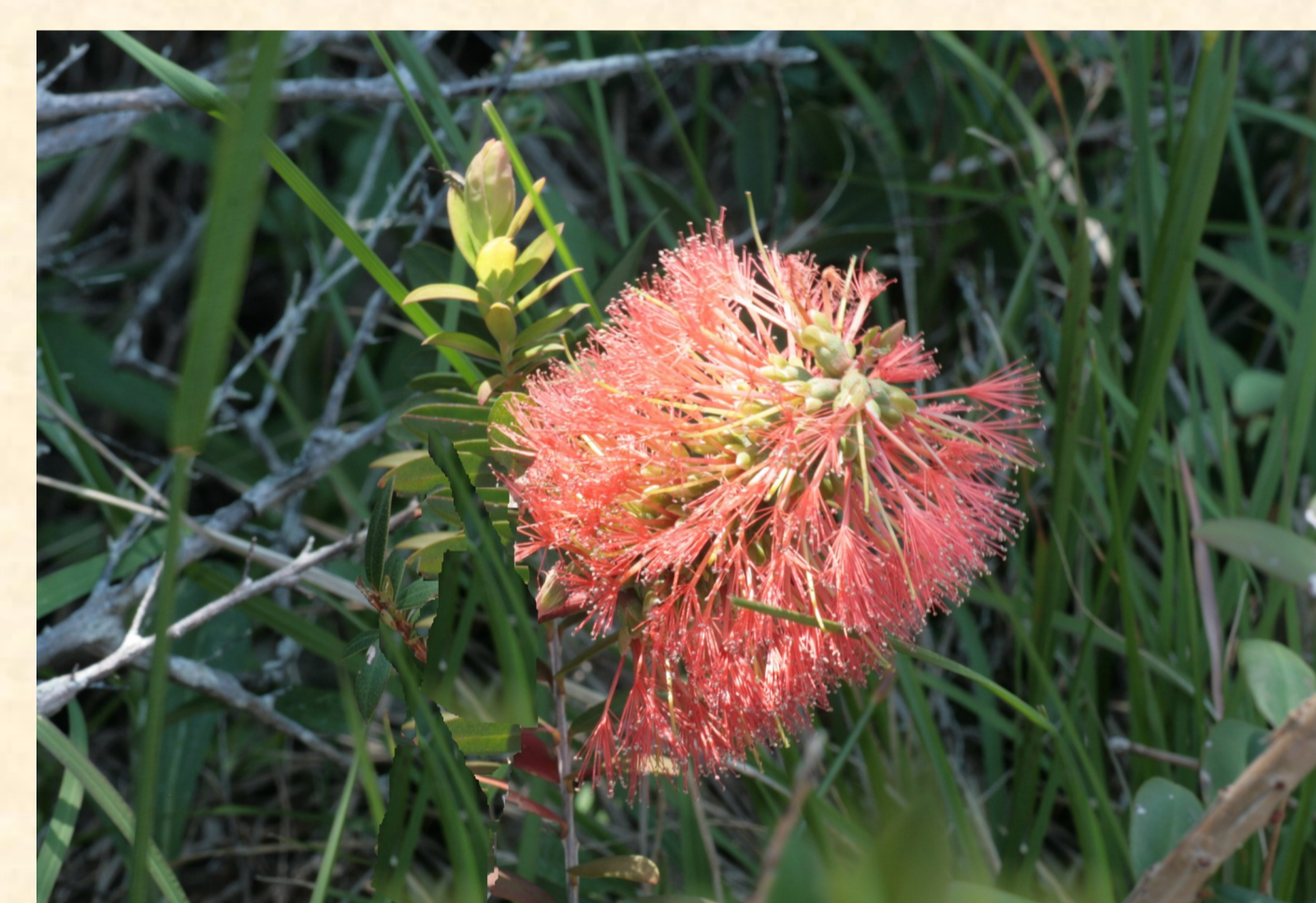
Melaleuca hypericifolia Paper-bark