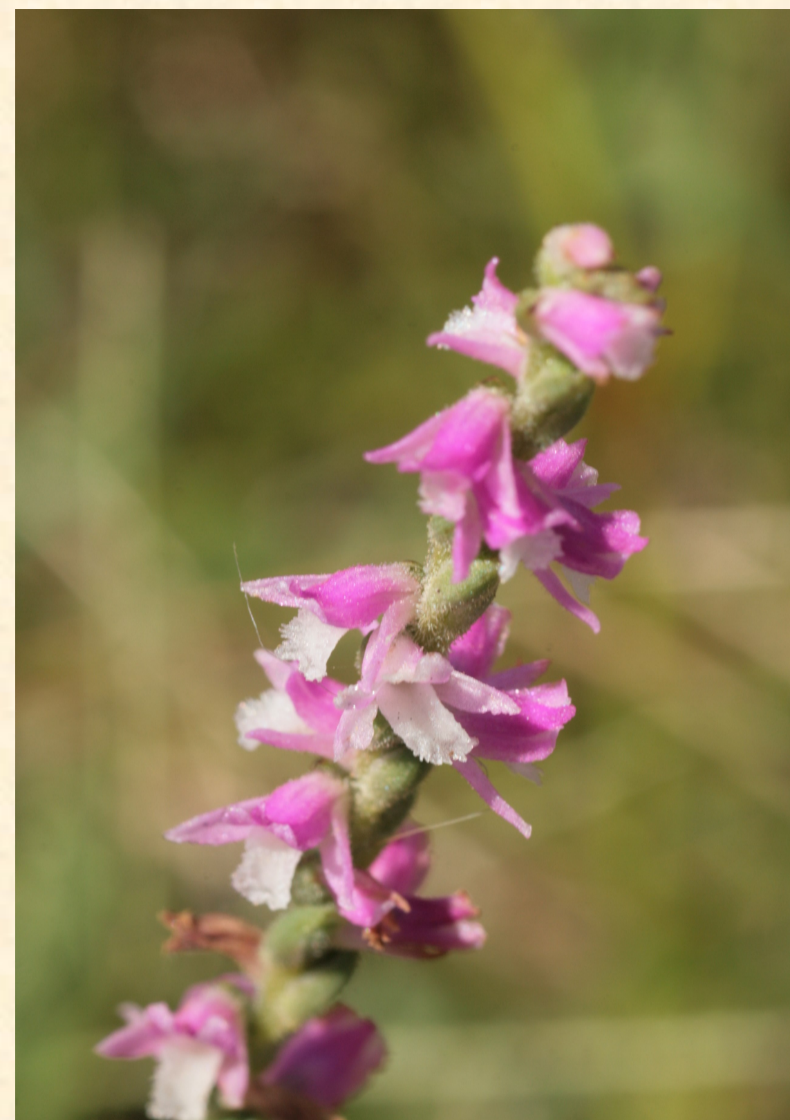
Spiranthes australis Ladies' Tresses