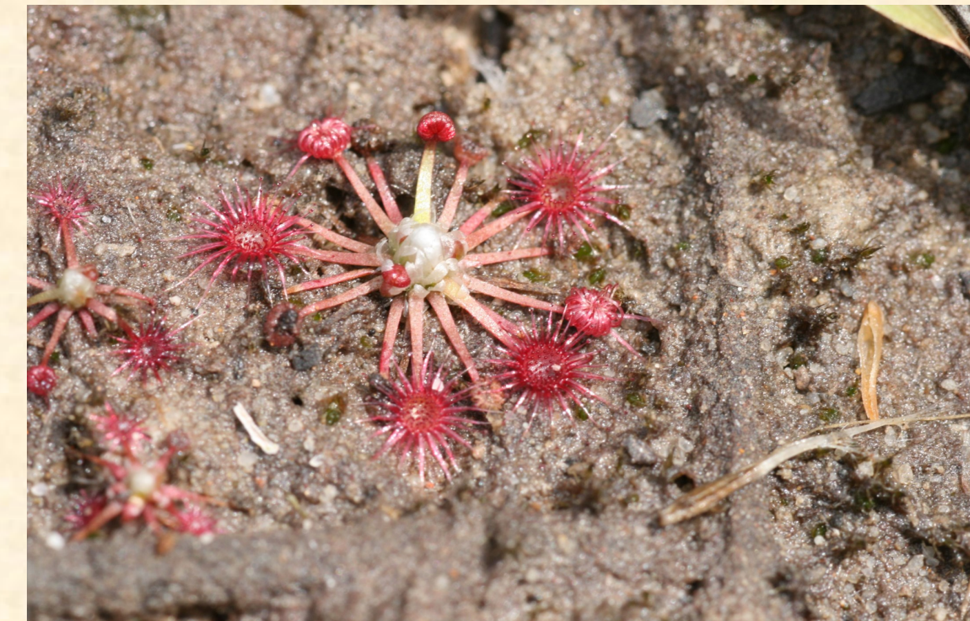
Drosera pygmaea Pygmy Sundew