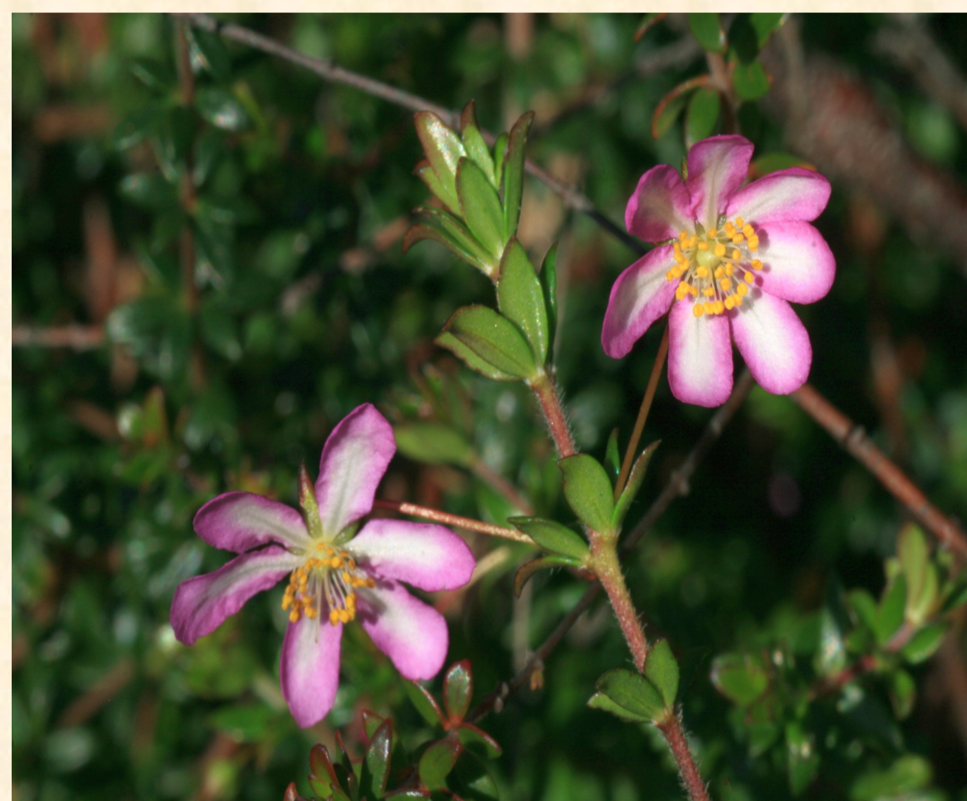
Bauera rubioides ESBS River Rose