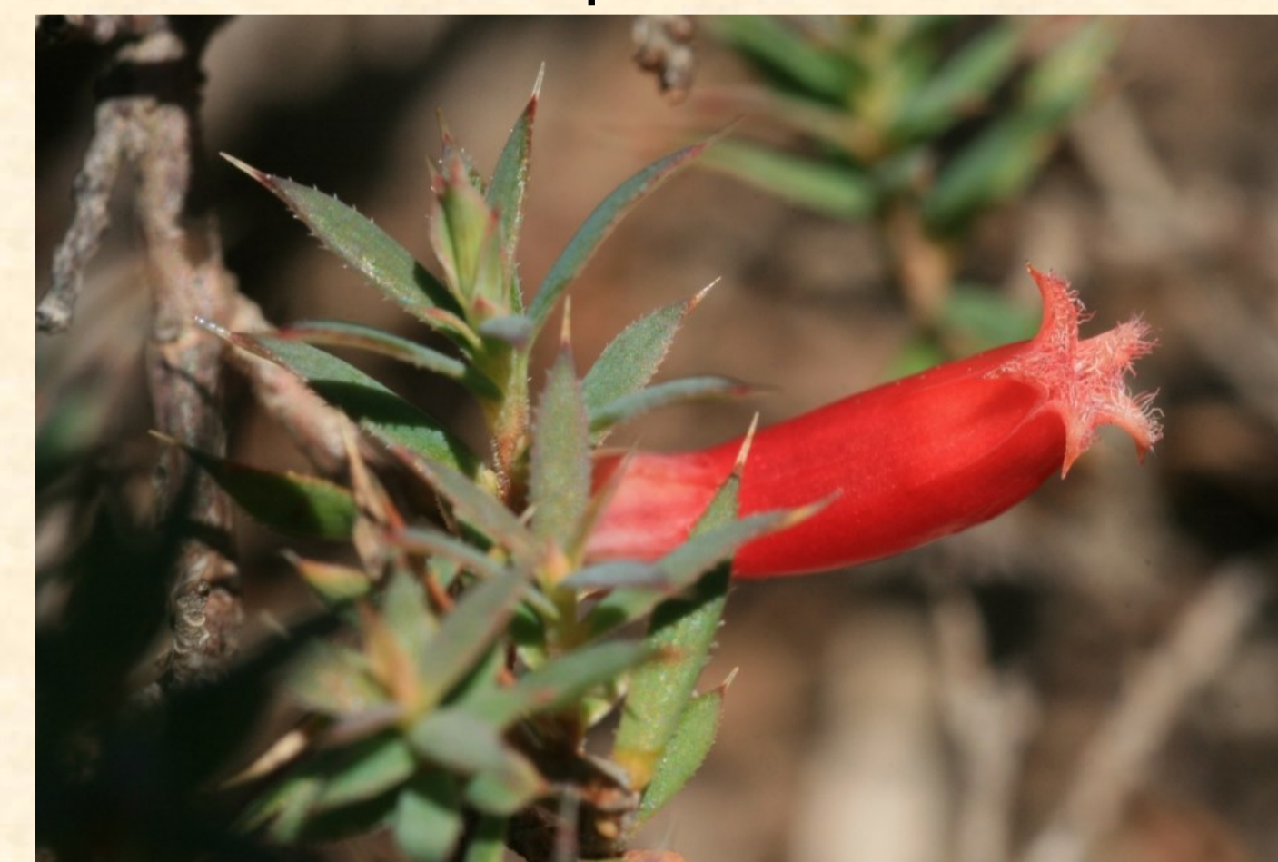
Astroloma humifusum ESBS Cranberry Heath