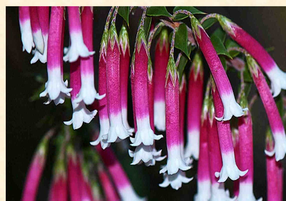
Epacris longiflora ESBS Fuchsia Heath