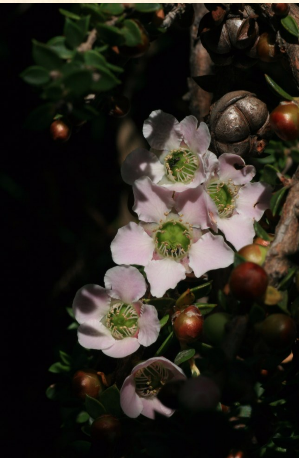
Leptospermum squarrosum ESBS Pink Tea Tree