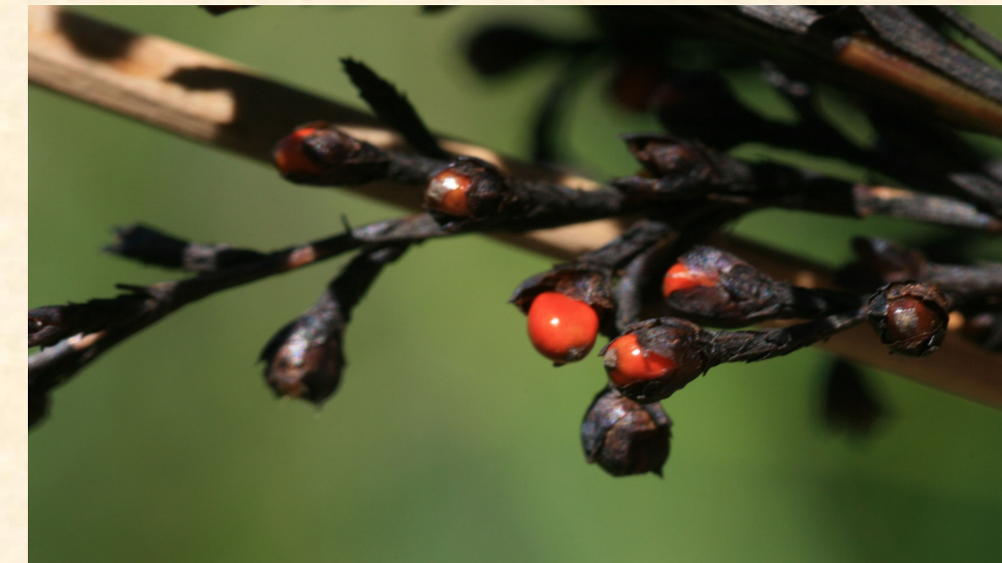
Gahnia clarkei Tall Saw Sedge