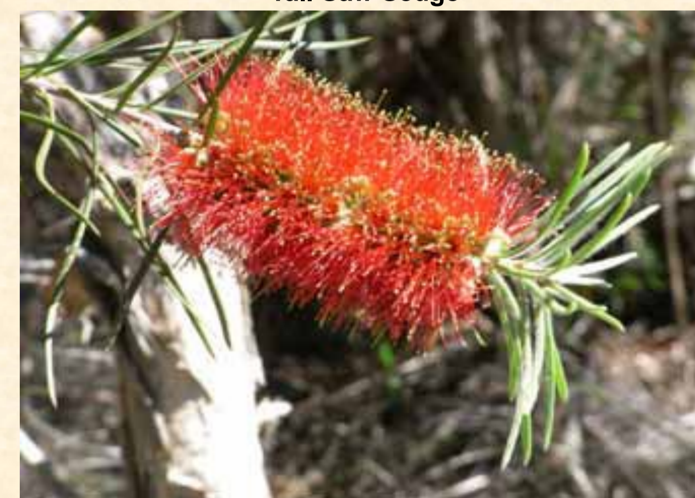
Callistemon linearis Narrow-leaved bottlebrush