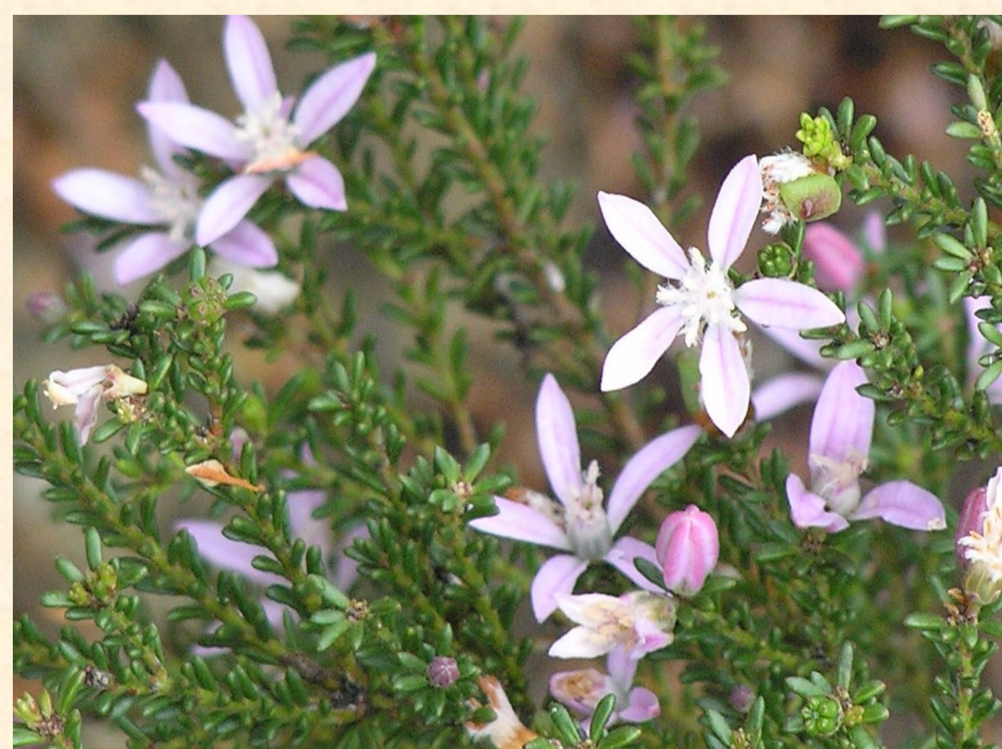
Philotheca salsolifolia Philotheca