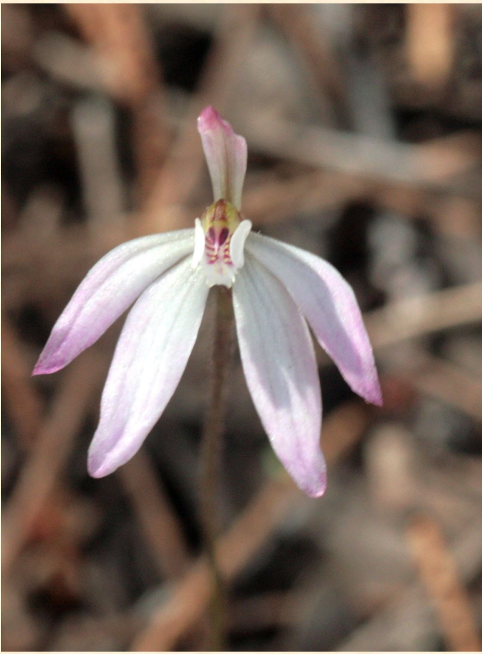
Caladenia carneus Pink Fingers