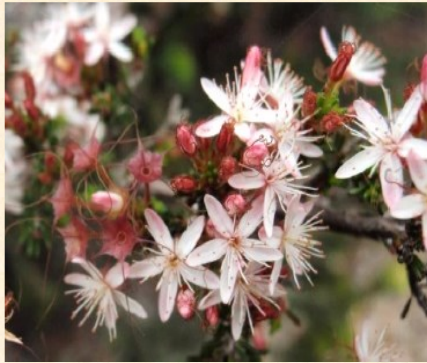
Calytrix tetragona Fringe-myrtle