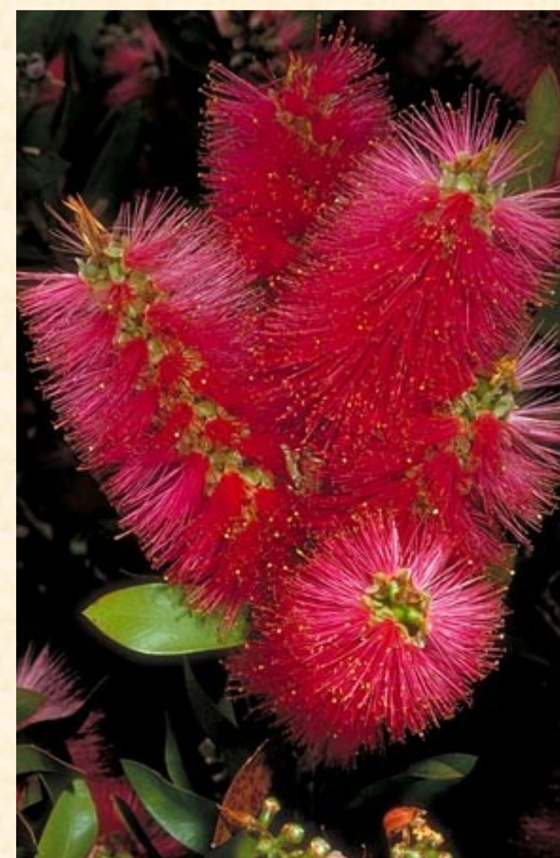
Callistemon citrinus Red Bottlebrush