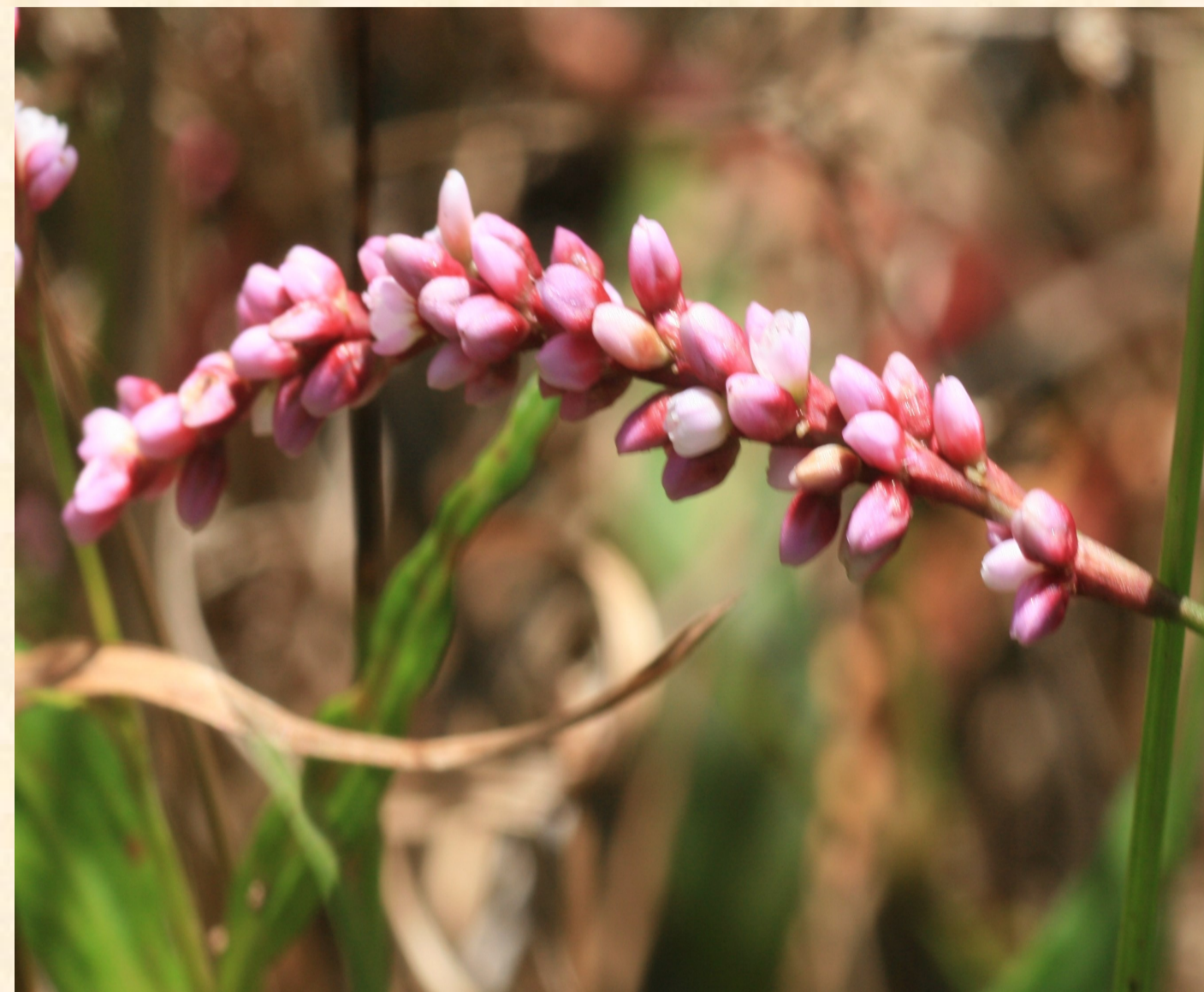
Persicaria decipiens Slender Knotweed