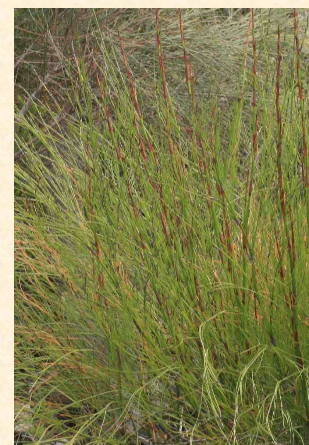
Restio fastigiatus ESBS Tassel Rush