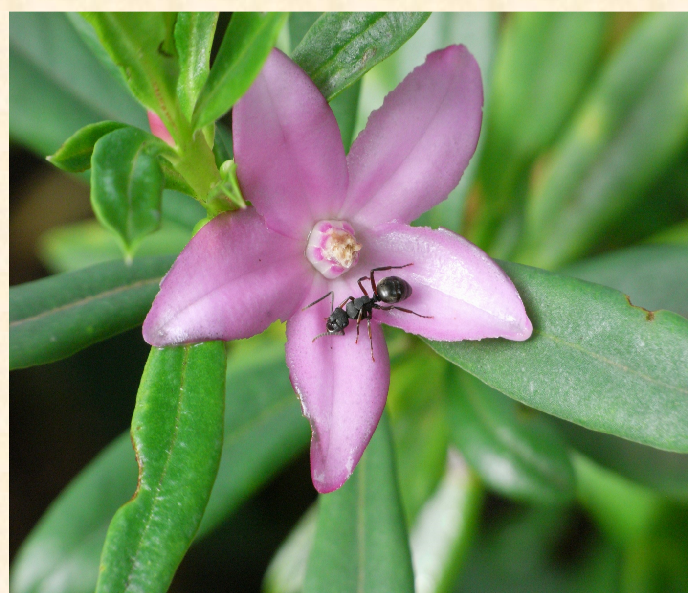
Crowea saligna Crowea