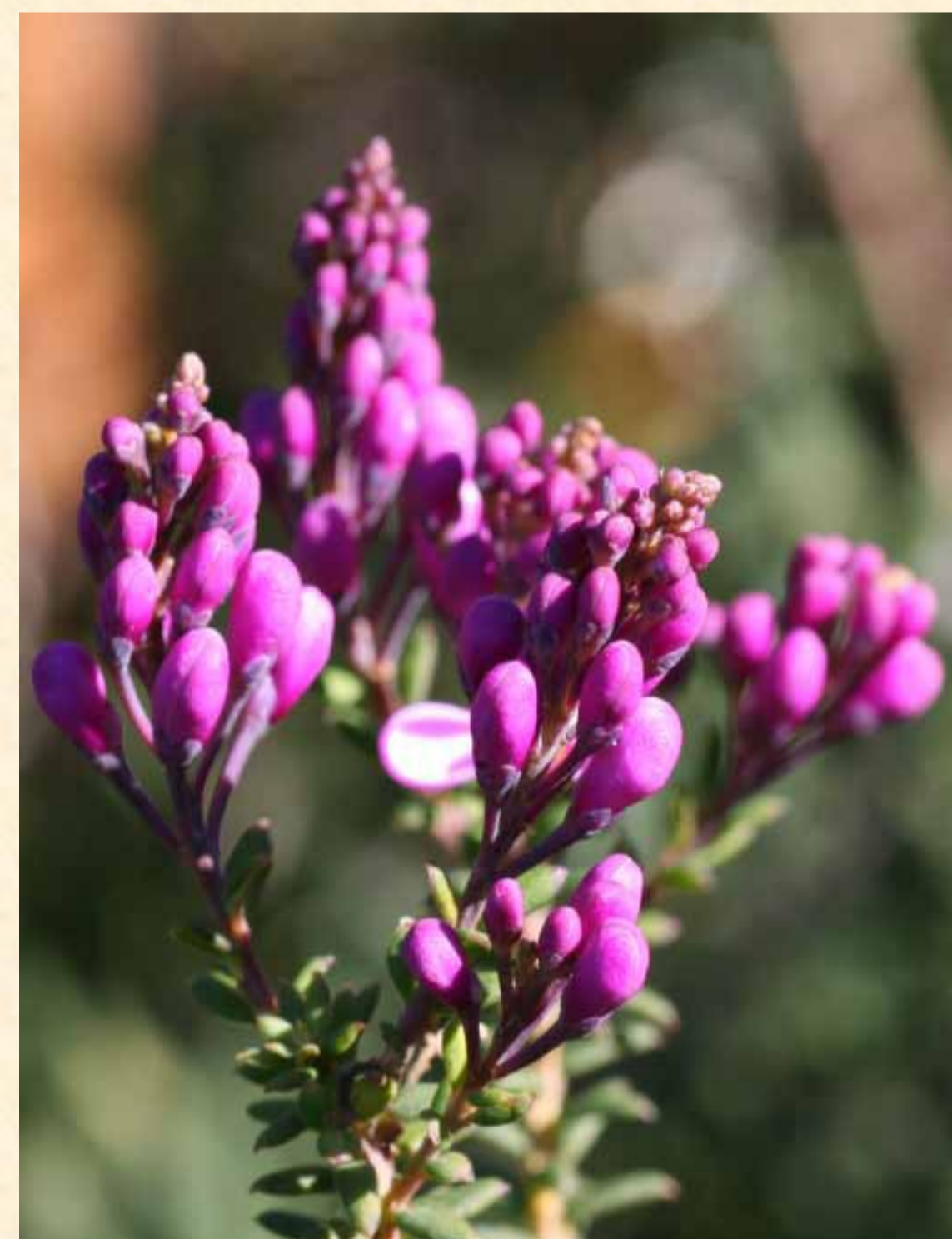
Comesperma ericinum Pink Matchheads