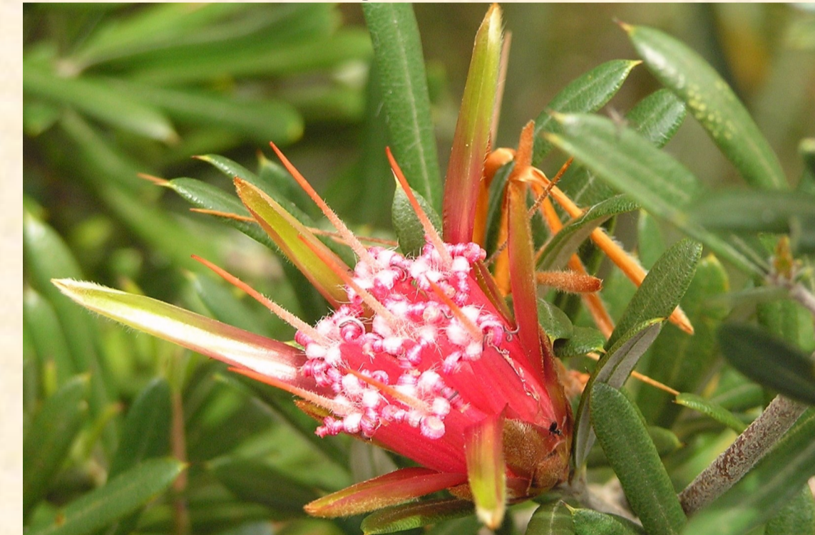
Lambertia formosa ESBS Mountain Devil